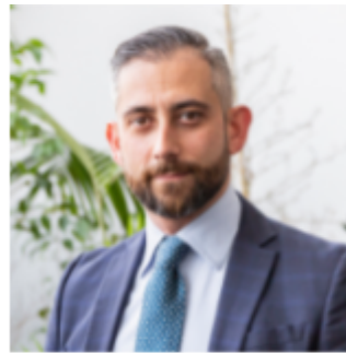
General Manager Italy & Eastern Europe