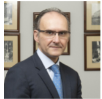
CEO Spain & Latam